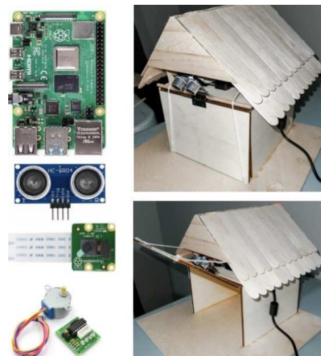
Figure 3. One of the senior design projects: Smart Car Garage device capable of recognizing and identifying plate numbers

Since this is a WIP paper, we haven't thoroughly evaluated the effectiveness of our new industrial-based PBL senior project, but for example, to assess the performance of our smart car garage device (Fig. 3), we conducted a series of experiments in simulated and real-world environments. The metrics evaluated include license plate recognition accuracy, de-identification effectiveness, and overall system reliability. Our device demonstrated high accuracy in recognizing authorized license plates in various lighting. This reliability ensures that only authorized vehicles gain access to the garage, enhancing security and convenience for users. The de-identification process (Fig. 4) proved vigorous, effectively anonymizing unrecognized license plates without compromising data integrity. Through randomized replacement of identifiable characters, the device mitigates the risk of unauthorized access or misuse of personal information. The smart car garage device exhibited consistent performance and operational reliability throughout our testing. It processed incoming vehicles promptly, minimizing delays and ensuring seamless access control.